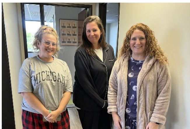
Staff members enjoyed PJ Day!