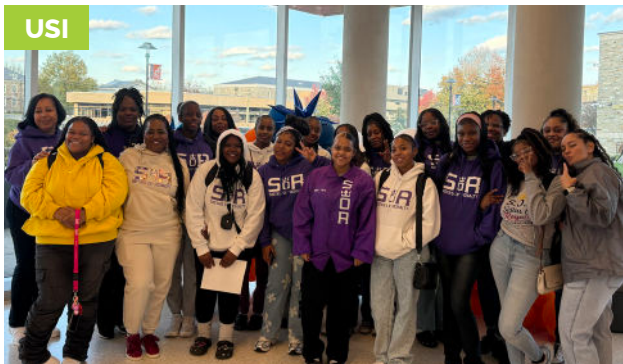
A group of 8th-12th grade girls toured HBCU colleges in Washington, D.C., visiting Howard University and Morgan State University on an all-expense-paid trip through a partnership with SOR: Sisters of Royalty.