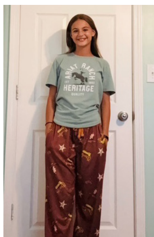
Students enjoyed PJ Day!