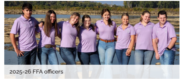
2025-26 FFA officers