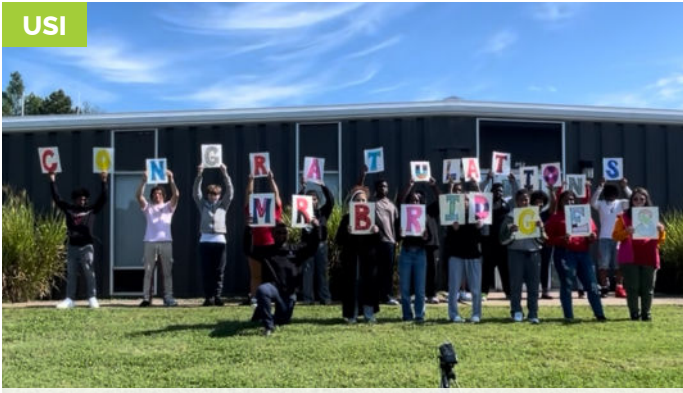
Students and faculty congratulate new USI President with creative "Congratulations" banner and heartfelt messages.