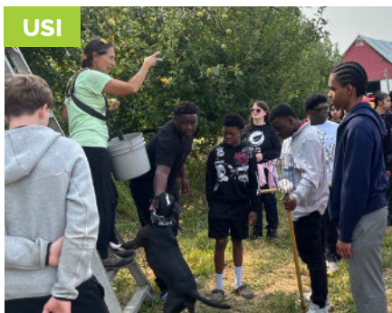
Students visited Evansville Countryside Orchard and learned about different apple trees.