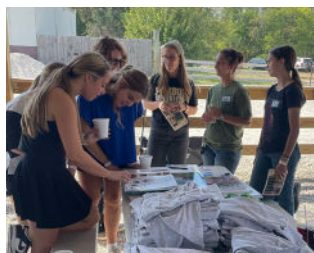
Families gathered and enjoyed Stuckey Farms.