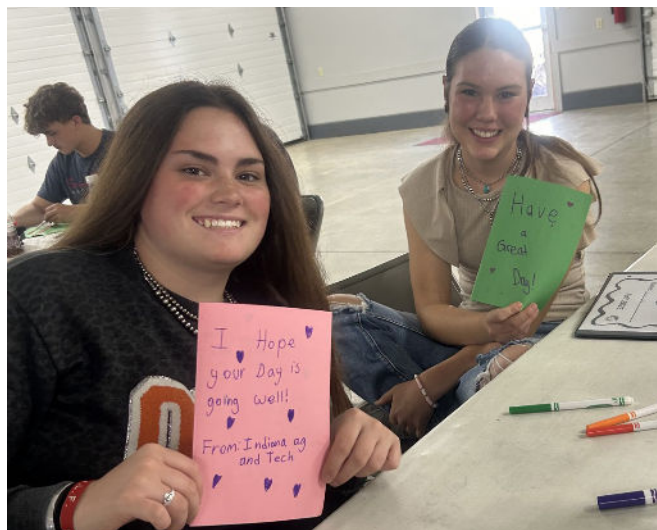
Students participated in various service activities.

Students, staff, and families celebrated IATS' first-ever Homecoming at the end of September! The week was filled with engaging student activities for themed dress-up days, alumni sessions, new club announcements, plus a special gathering at Stuckey Farms in Sheridan, IN, that featured games, food, and fun memories that brought our community closer together. A huge thank you to everyone who helped make it happen!