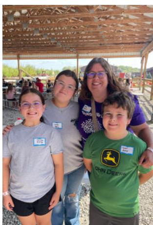
Families gathered and enjoyed Stuckey Farms.